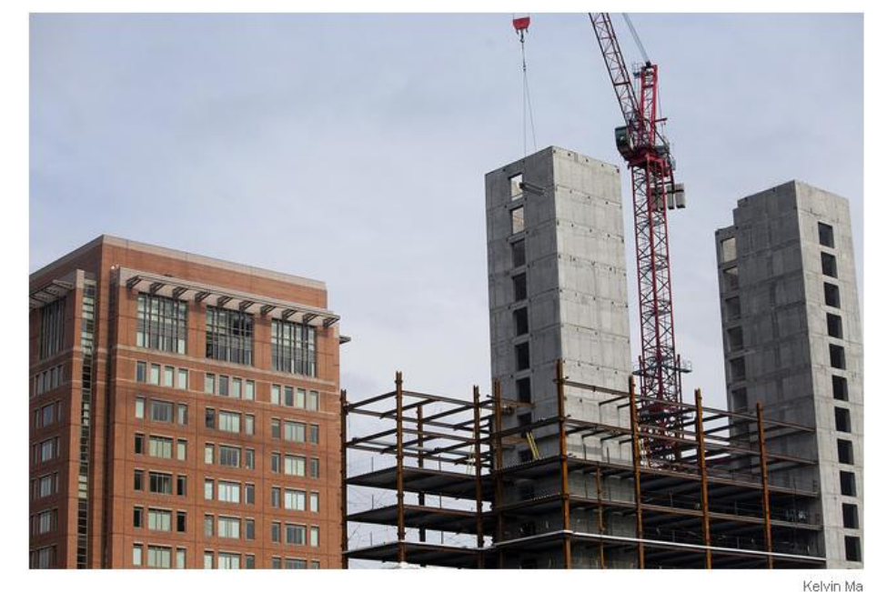
Developers and investors drawn to Boston's expanding life sciences and technology industry, along with a growing workforce of educated young adults, are fueling a boom in construction from the Seaport to downtown and Cambridge.

Boston's cumulative job growth, led by scientific and technical services, is projected to be 7.9 percent from 2011 to 2016, exceeding the state's 7.4 percent, according to the report. The city is home to financial firms such as