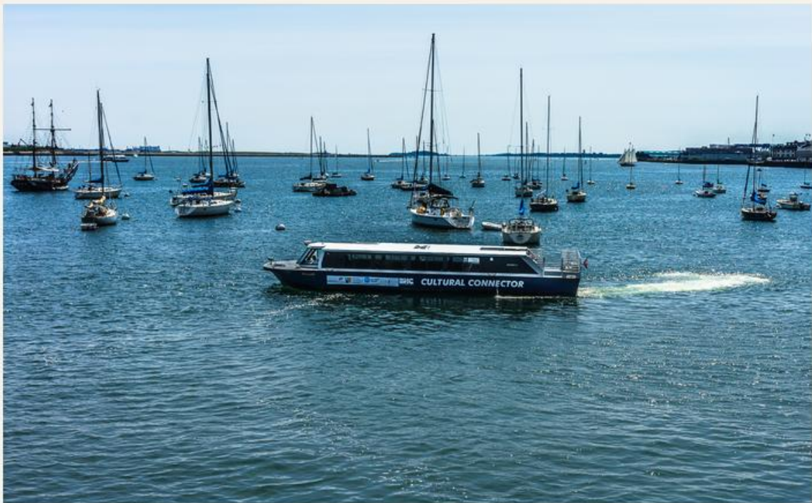
Cultural Connector, near the Aquarium Stop in Boston Harbor