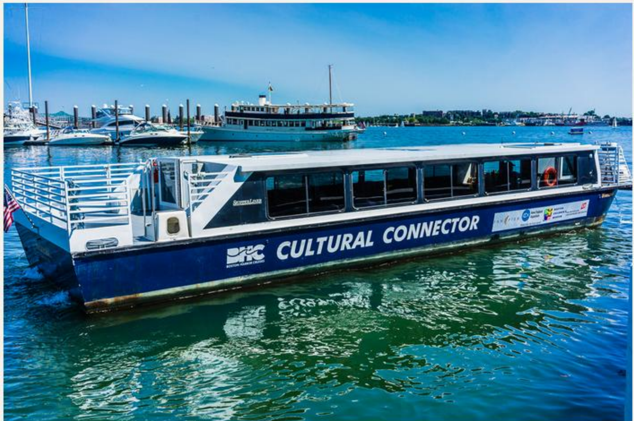
Cultural Connector leaving the Seaport Dock at Fan Pier in Boston Harbor

It was a beautiful day to be on the harbor as I took a ride on the Cultural Connector to capture these photos.