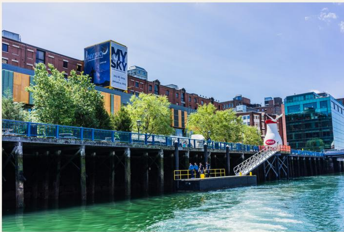
Newly installed dock at the Children's Museum at Fort Point