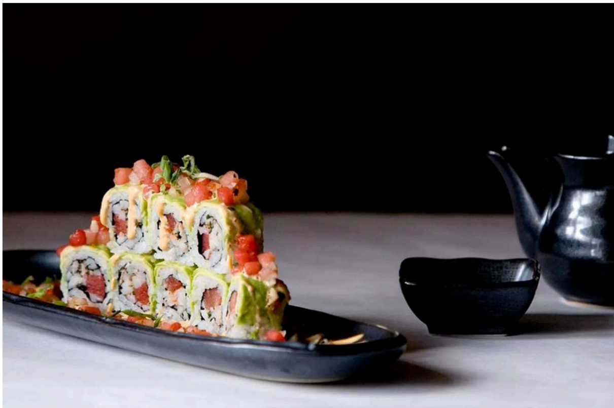
Sushi at LoLa 42